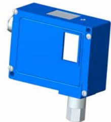
S203 Weatherproof High Pressure