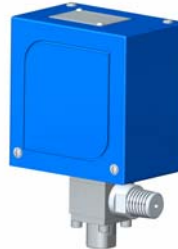
S202 Weatherproof DP Switch