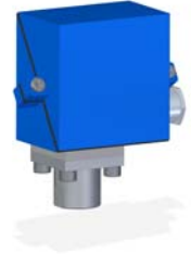
S104 Miniature Internal Adjustment