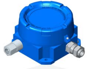
S303 Flameproof High Pressure