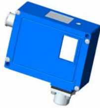
S201 Weatherproof Industrial, High Accuracy