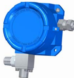
S302 Flameproof DP Switch