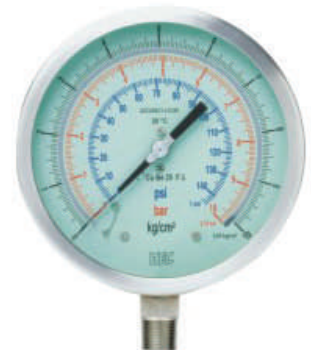
P801 Test Gauge Acc. 0.25%