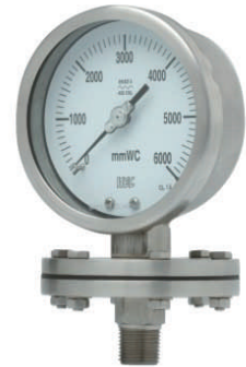
P602 All SS Pressure Gauge Diaphragm