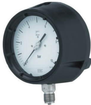
P204 High Safety Pressure Gauge Solid Front Full Blow Back