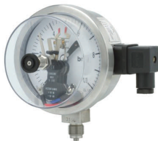
P501 Mechatronic Gauge Dome style