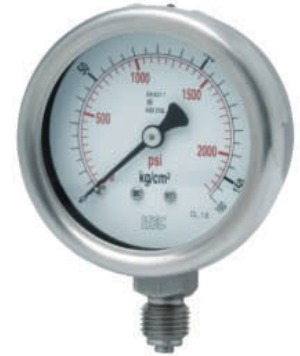
P103 All SS Pressure Gauge 63 mm & below sizes