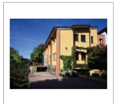
ITEC srl, Invorio (NO), Italy

The facility was equipped with most modern testing and calibration instruments with manufacturing set up to serve our European customers especially in Italy, France, Spain and Greece to provide customized solutions as per the industry requirements. In Europe write to us at info@itec.it