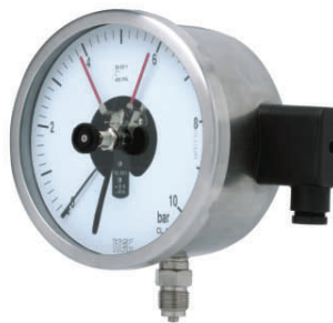
P502 Mechatronic Gauge Hi-Version case