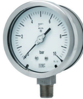
P201 High Safety Pressure Gauge Solid Front Full Blow Back