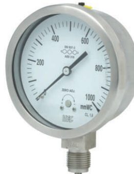
P601 All SS Pressure Gauge Capsule