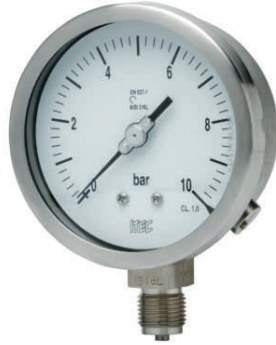
P102 All SS Pressure Gauge External Zero Adjustment